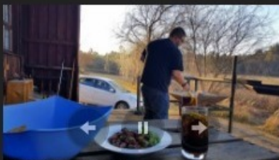
Dullstroom: Getting ready for the braai