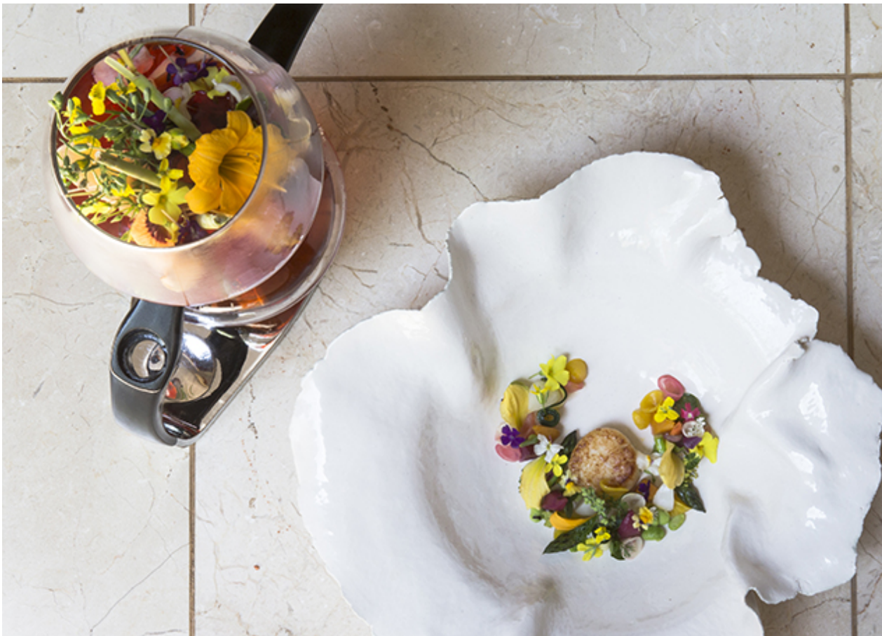
The Alchemist Infusion: Saffron tortellini with hibiscus consommé Restaurant Mosaic. Photo supplied.

This year Restaurant Mosaic at The Orient celebrates a decade since its opening. It's been a great year for the restaurant, scooping a load of international accolades and taking the number five spot in Top 10 of this year's Eat Out Mercedes-Benz Restaurant Awards , the only Gauteng restaurant to make the cut.