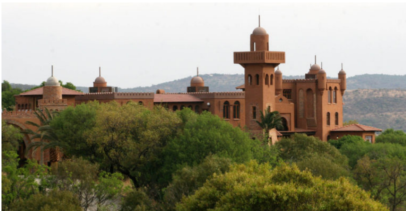
The Orient – home to Restaurant Mosaic

Restaurant Mosaic hosts one of the finest wine cellars in the country, with some of the best and rarest local and international wines. There are more than 55 000 bottles under 1 350 different labels from South Africa and around the world.