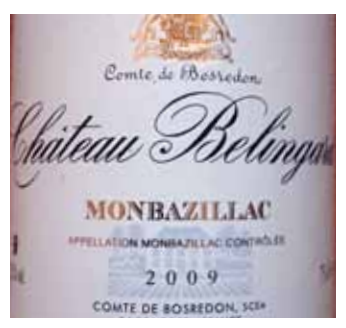
Château Bélingard Monbazillac AOC 2009

Full nose with notes of honey, wax, candied fruits and aromas characteristic of botrytis. Powerful, yet still maintains a touch of acidity.