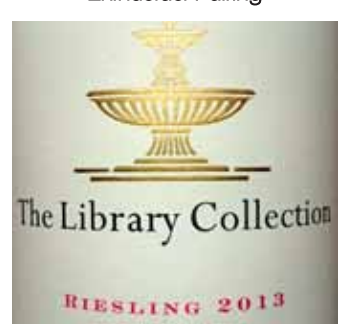
Waterford Estate The Library Collection Riesling 2013

This wine shows delicate floral fruit and a distinctive kerosene note forming an integral part of the aroma profile of classic Riesling.