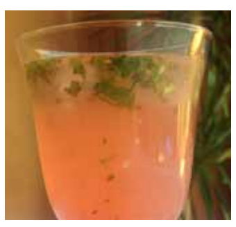
Virgin Pomelo and Lime Margarita

In Chinese culture, Pomelo is a sign of prosperity and good fortune. It is known to be abundant with vit C, betacarotene and the B vitamins.