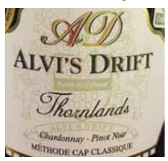
Alvi's Drift Private Cellar Thornlands MCC Nv

Aromas of freshly baked bread crust and biscuits dominate the nose and is pleasantly complimented with a balanced and dry finish.