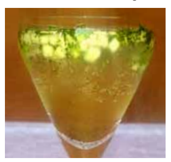
Apple and Fennel Cooler

Fennel is highly prized for its licorice-like flavour and the myriad of health benefits like digestive problems and upper respiratory tract infections.