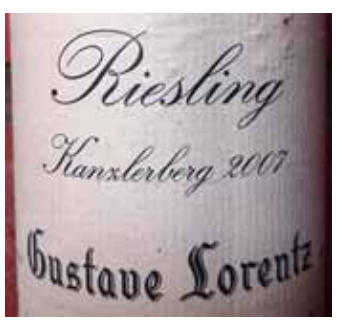
Gustave Lorentz Riesling Grand Cru Kanzlerberg 2007

A straw-yellow colour. Great nose with some exotic dried fruit, lots of kerosene, freshly baked bread, grated lemon peel and ginger aromas. A full taste that quickly overlap with a mineral acidic bite that lingers on the palate.