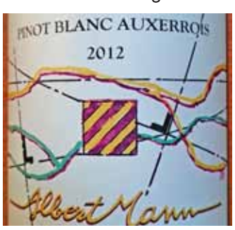
Domaine Albert Mann Pinot Blanc Auxerrois 2012

Straw-coloured with clear green reflexes. Fresh and fruity, the nose is pleasant with a white fruit finish. Beautiful expression of Auxerrois.