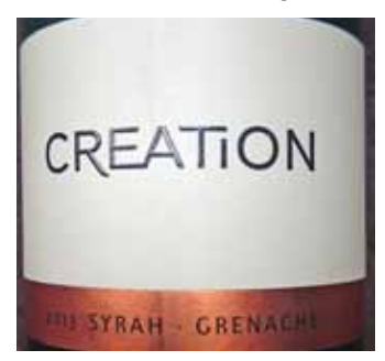
Creation Syrah / Grenache 2013

Alluring aromas of ripe black olive elegantly complemented by whiffs of pepper. A well-endowed, fullbodied Rhône-style blend.