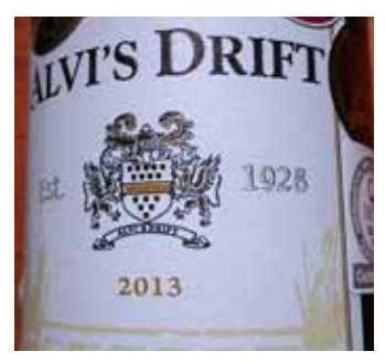
Alvi's Drift Viognier 2013

The aromas are dominated by apricots and white peaches. The wine is soft, ripe, and round with a lovely viscous texture.