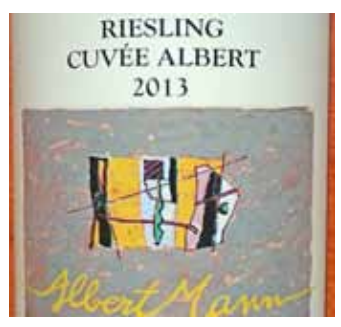
Domaine Albert Mann Riesling Cuvée Albert 2013

Pale yellow-gold colour. A lively white, framed by bright, snappy acidity, this offers fruit-forward flavours of yellow peach, tangerine and melon, as well as a streak of stony minerals that echoes on the finish.