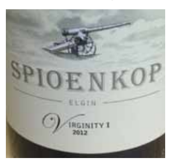
Spioenkop Virginity 1 2012

Crystal clear, light gold colour. You will discover a surprisingly complex nose of pineapple, peach, black current leaves, gooseberry, fern and some honey. This rebel has a well rounded finish that is crisp and crystal clear.