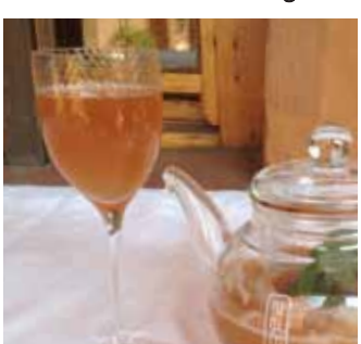
Rooibos and Citrus Tea

Rooibos tea, one of South Africa's most icon ingredients is known to contains powerful antioxidants that have a strong cancer-fighting effect. Rooibos also lowers the production of cortisol – the "stress hormone".