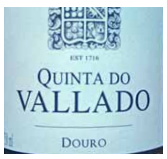
Quinta do Vallado Reserva Branco 2013

Beautiful clear white-gold colour. Aromas with mineral notes are found on the nose, showing subtle hints of well integrated oak.