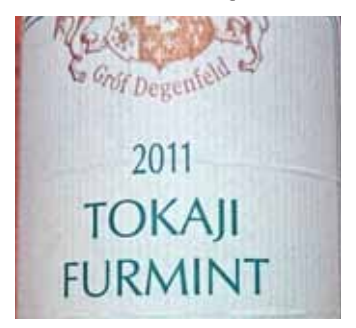
Gróf Degenfeld Furmint selection 2011

It is floral with notes of honey, citrus, apple, peach, pear, grapefruit and fresh herbs dominating both the nose and palate. Clean and balanced.