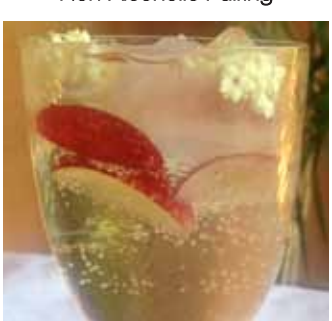
Muscat Grape and Elderflower Water

Elderflower is used in traditional medicine for its antiseptic and anti-inflammatory properties. It also reduces blood sugar levels - similar to insulin.