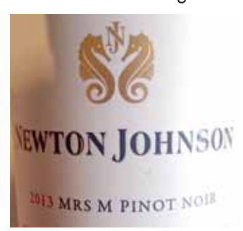
Newton Johnson Family Vineyards Mrs M Pinot Noir 2013

Fine light red colour with lots of character, showing dark red fruit and evident maceration. Beautiful sweet cherry fruit with long complex notes.