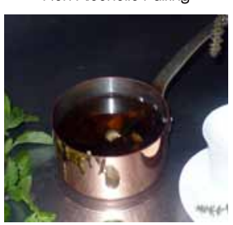
Wild Mushroom Consommé

Mushroom Tea is a staple of Eastern medicine. Its Chinese name, ling chih, means "mushroom of immortality" and improves well-being.