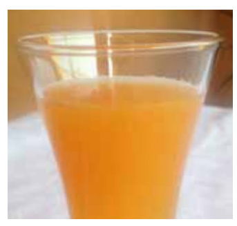
Passion Fruit, Vanilla and Peach Extraction

Vanilla is the only edible fruit of the orchid family, largest family of flowering plants in the world and was believed only to have value as a perfume.