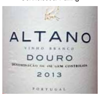
Symington Altano Branco 2013

Herbal and zesty aromas show tropical fruits; lychees and passion fruit, brimming with youthful vigor and a crisp acidity.