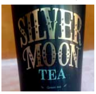
Silver Moon Green Tea and Berry Infusion

A blend of green teas accented with a grand berry and vanilla bouquet. Suave, with just a hint of spice. A tea for that special moment.