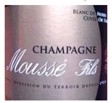
Moussé Fils Blanc de Noirs Cuvée Or Tradition Nv

This champagne is full of fruit on the nose and is generous in the mouth with a long lasting finish. It delivers quality from start to end.