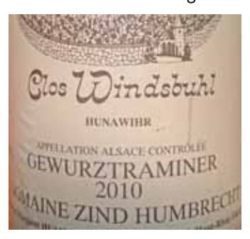
Domaine Zind-Humbrecht Gewürztraminer Clos Windsbuhl 2010

Lots of fruity and exotic aromas at first, then opens up to more complex spicy flavours. The palate is uncluous and round.