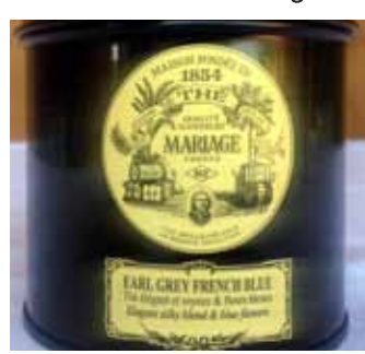
Earl Grey and Lavender Soother

This quintessentially British tea is typically a black tea base flavoured with oil from the rind of the citrus fruit called bergamot orange.