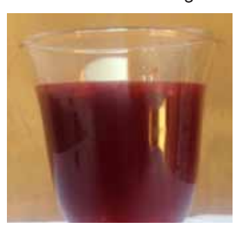
Beetroot and Ginger Smoothie

Ginger has a long history of use for relieving digestive problems such as nausea, loss of appetite, motion sickness and pain.