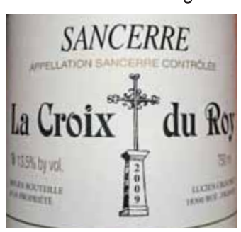
Domaine Lucien Crochet La Croix du Roy 2009

An intense, dark ruby red. Aromas of ripe black fruit, bilberry and blackberry, with hints of liquorice. Good ageing potential.