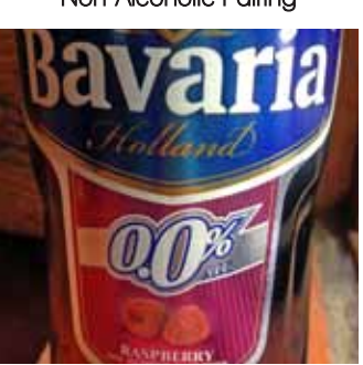
Bavaria 0% Raspberry Beer

Raspberries are rich in vitamins, antioxidants and fiber. They have a high concentration Of ellagic acid, a phenolic compound that prevents cancer