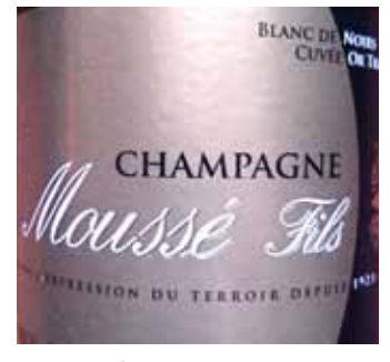
Moussé Fils Blanc de Noirs Cuvée Or Tradition Nv

This champagne is full of fruit on the nose and is generous in the mouth with a long lasting finish. It delivers quality from start to end.